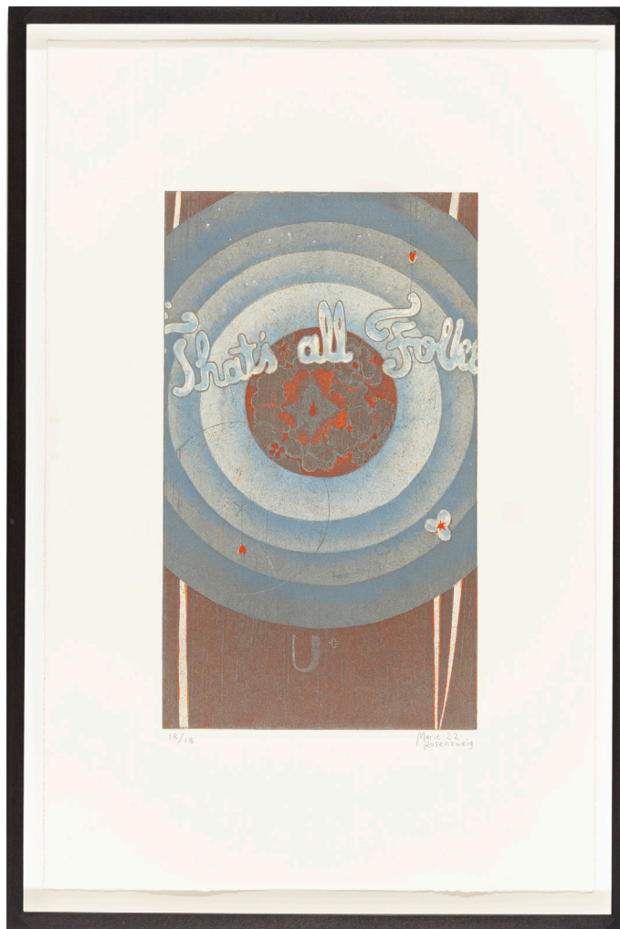
Marie Rud Rosenzweig, Liminality , 2022 Spit bite aquatint, aquatint, line etching, open bite & burnishing on Hahnemühle Bütten 300g 55,5 x 37,5 cm (21.85 x 14.76 in) framed Edition of 18 + 5 AP 320 EUR; frame 160 EUR Reg# MaR 22 001